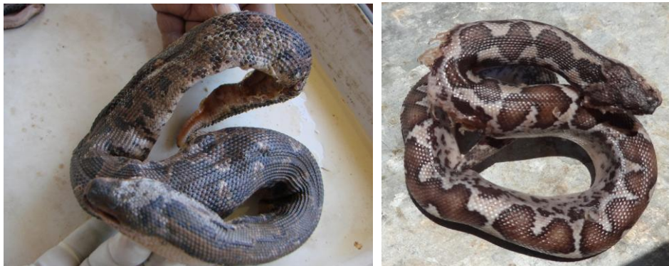
Figure 3: Comparison of Body Color between E. conicus (Left) and G. conicus (Right) Dark Brown Blotches with Black Margin in E. conicus Whereas Blotches are Not So Dark Without Prominent Margin in Case of G. conicus