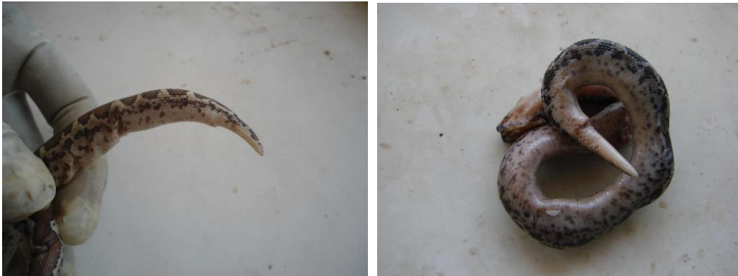
Figure 2: Tail Tips of E. conicus (Left) and G. conicus (Right) it Shows Curved Tail in E. conicus But Straight in Case of G. conicus